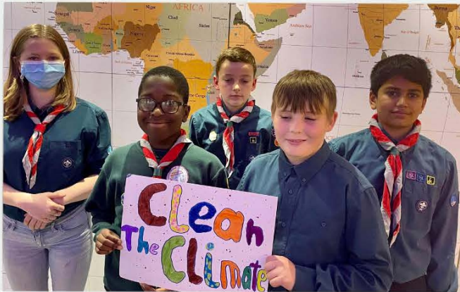
35th Glasgow Scouts COP26